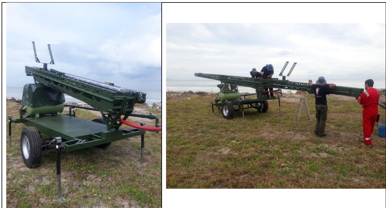
Target Drone Launcher

The pneumatic launcher system is designed to launch unmanned aerial vehicles with a maximum take-off weight of up to 120 kg at a speed of 30 m/s. At the same time, the launch speed of lighter UAVs can be higher, up to 40 m/s. The pneumatic launcher is capable of launching UAVs in a variety of weather conditions and in the temperature range from -5^{\circ} to +50^{\circ} C. We offer full training courses in operating pneumatic launchers for all clients.