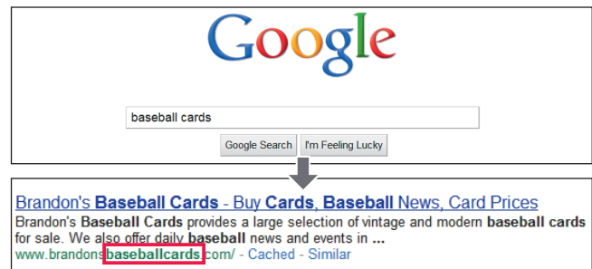
(3) A user performs the query [baseball cards]. Our homepage appears as a result, with the URL listed under the title and snippet.