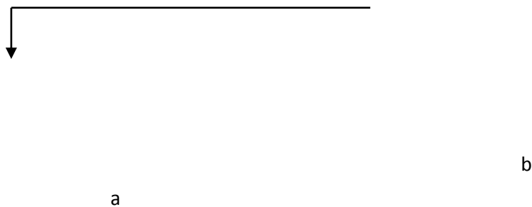
Figure 1: The layout of carved components at wall facade of rumah ibu at Mohamad Dobah's house (a) and one of carved ventilation panels (b) found on the wall

The analyses signified a certain pattern of distribution of carved components in each house and its compositional motifs in relation to the architectural elements and the house form. The placements of the carved components were fixed within the specific arrangement and significant functions and uses. It appears that the carved components in forms of ventilation panels were widely found on walls at rumah ibu (core house). It is the core area of the traditional house and usually located at the centre of the house. Rumah ibu is the largest and principal area of the traditional Malay house that serves most of household activities such as receiving house guests, sleeping, praying and gathering (Lim, 1987; Abdul Halim and Wan Hashim, 1996). Muhammad Dobah' house from Kota Bharu, Kelantan is one of the examples of the traditional house that exhibits the placement of several carved panels as an integral part of the wall component as illustrated in Figure 1a. The carved panels were produced with distinctive features of carving attributes that gave the front façade of the house its defining character. For example, as appeared in the carved ventilation panel fitted on the upper left hand side of the wall as shown in Figure 1b.