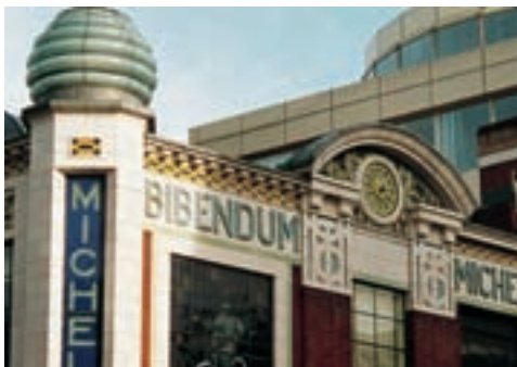
Michelin building, Fulham Road, London