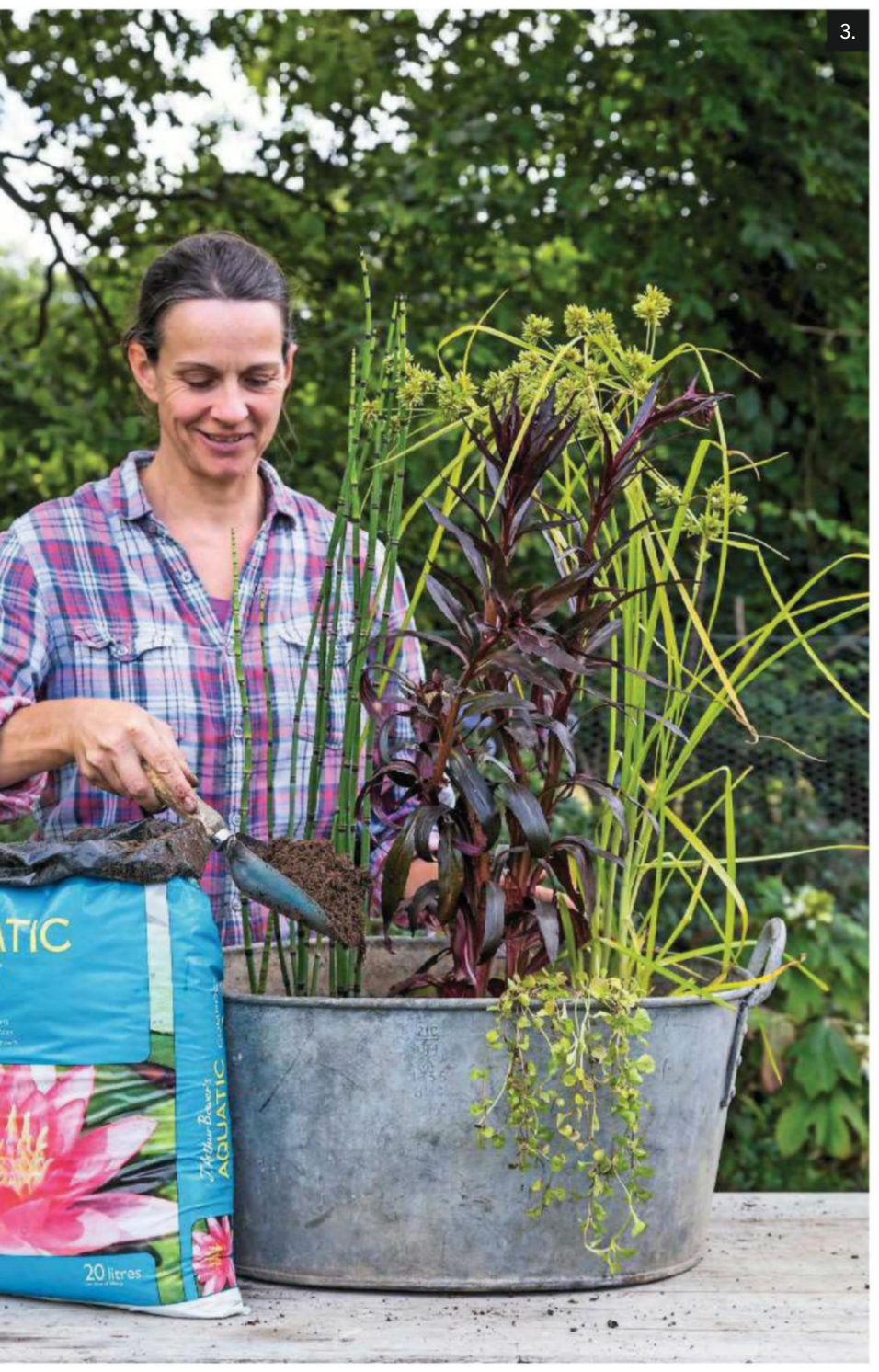
Step 3: The tin bath is filled with more of the aquatic compost, using a trowel to carefully bed in the plants. The succulent herb Veronica beccabunga , or brooklime, trails over the side of the bath for added interest.