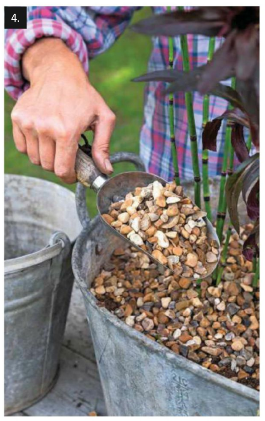
Step 4: Adding a mulch of gravel to the compost will help with water filtration. The extra layer also creates a neat and tidy appearance at the top of the container.