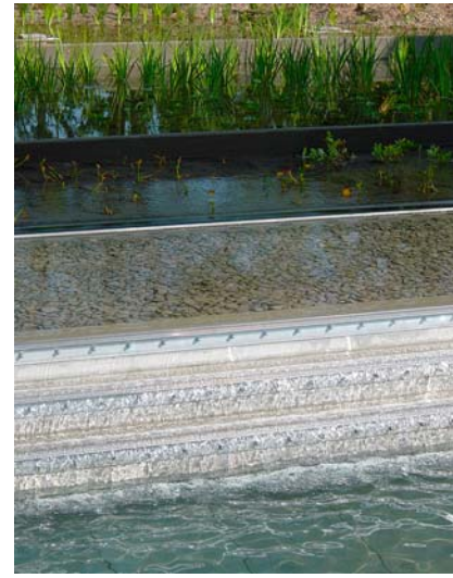
The water is circulated through a biotope which cleanses the water with natural effectiveness.

A low-stepped cascade beneath the Maybach Showroom functionally serves as the collection outlet for the water circulation and frames an attractive view from inside.