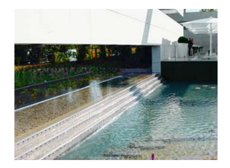
View through the cutout of the wall: the steps of the cleansing biotope are like a cascade and are planted with flowering plants. The wall builds a tension which makes the crossing of the bridge and the view from the terrace even more attractive.