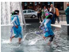
Activities for all generations

The water feature is a space sculpture which maintains transparency through the fine stainless steel meshes. Set with changing water flows, the screens alternate between being transparent and forming a soft visual barrier. They are also a sound set, pushing back the noise of the city.