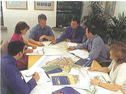
Presentation drawings are a very useful medium at meetings and workshops