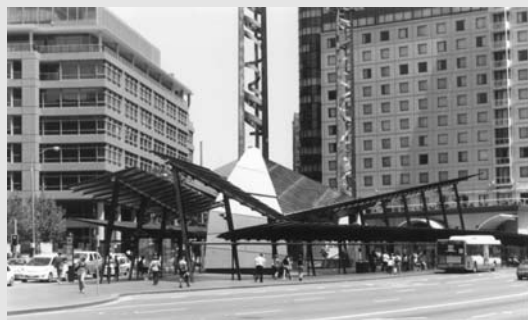
Figure 5.15 George Street Sydney, improvements. (a) The George Street location, (b) George Street North Proposal, (c) a typical intersection detail, (d) a general view towards the south, (e) a detail, (f) the bus station at the southern end.