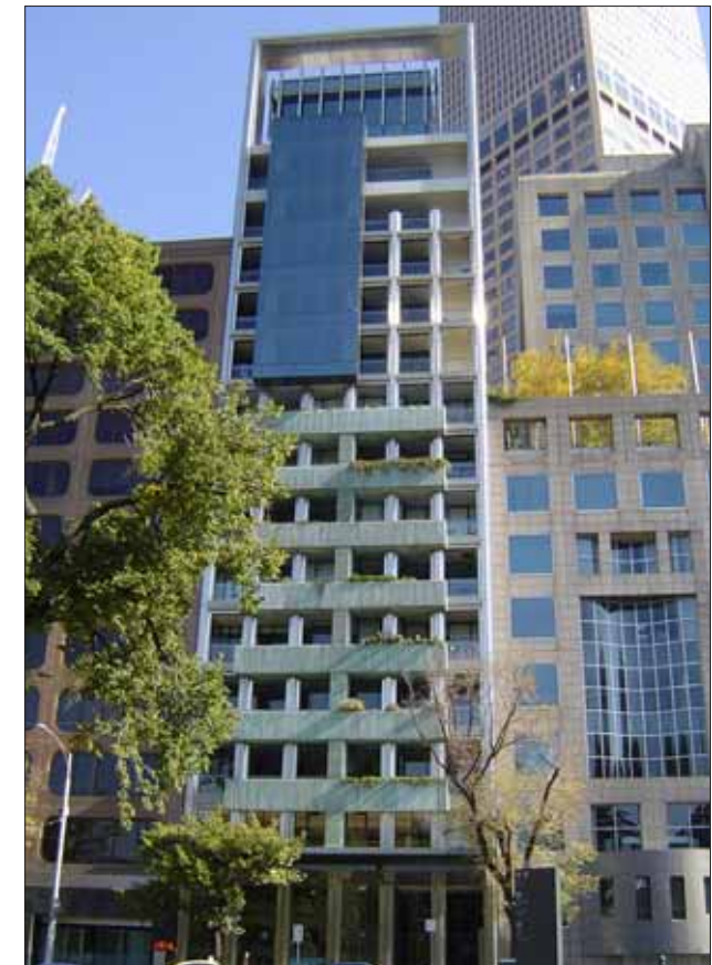
Infill residential development complementing the scale and articulation of adjacent facades, and enabling conversion of a previously underutilised site to desirable new uses

important district in its own right, complementing the Hoddle Grid to define the centre of Melbourne with the Yarra River as its focus. Cultural activities and visitor/tourism/recreation are the main local employment areas, in contrast with the City of Melbourne as a whole which is dominated by property and business services. 3