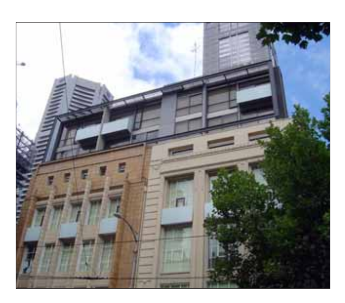
This page: The addition of new structures on top of existing buildings has helped to enable retention of various historic buildings by supporting economically viable redevelopment.