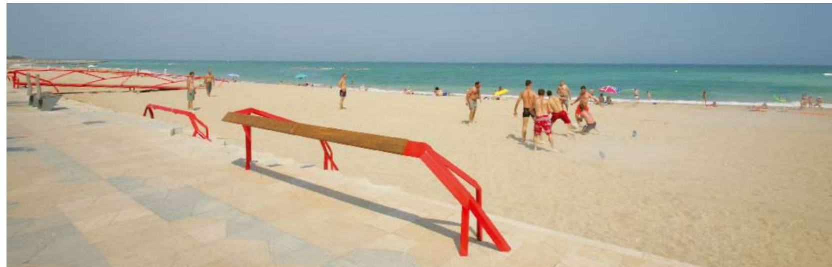
Right: General view of the promenade

It was also decided to eliminate the concrete wall separating the beach from the promenade to enable the whole area to be perceived as a continuous space composed of a variety of materials. Another significant decision was that the promenade, which at present has an irregular topography, should have a constant level that would set off its eight-hundred metre horizontal line against the natural line of the sea's horizon. This serves to resolve the difference in level between the beach and the promenade by means of a system of tiers that can be occupied in a variety of ways.