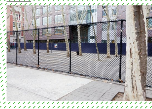
Błake Hobbs Play-za, New York, NY SCAPE Landscape Architecture