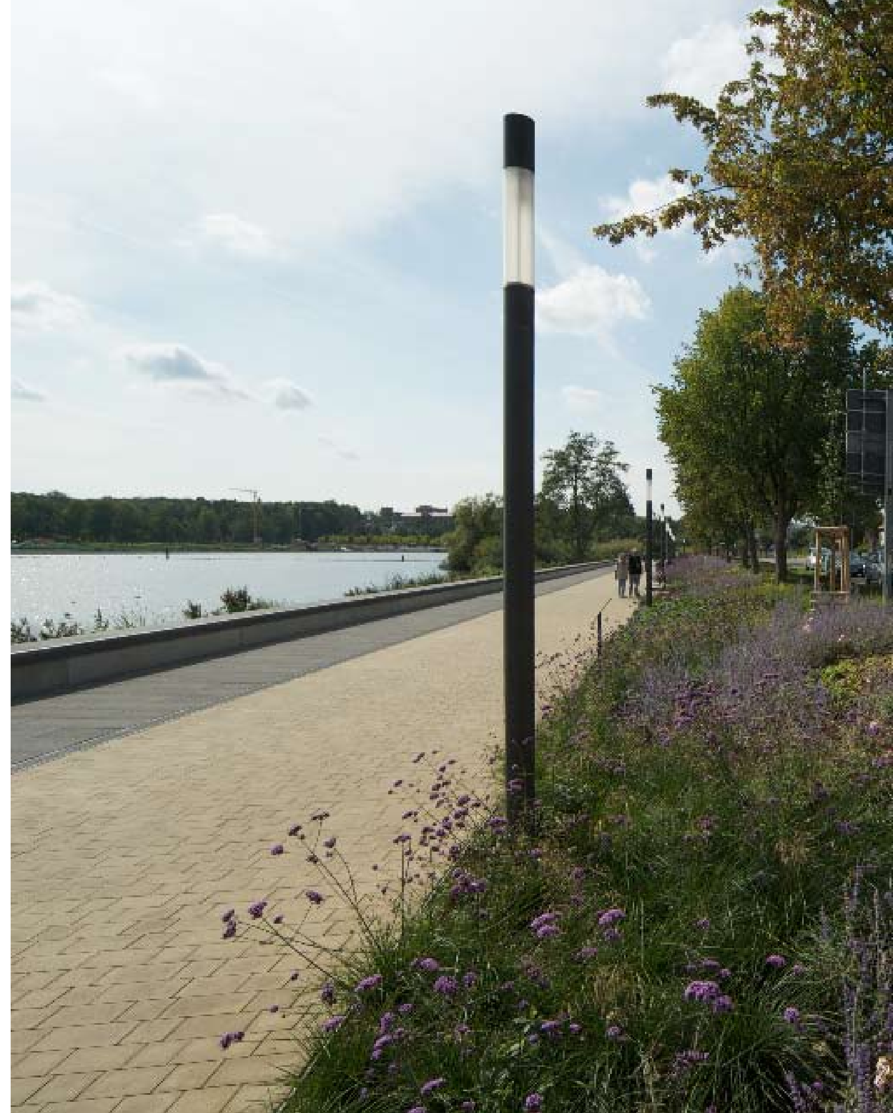
Right: Planting along the promenade