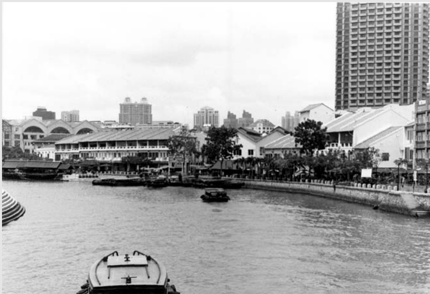
Figure 7.17 Clarke Quay, Singapore River. (a) The design controls for the riverside promenade, (b) the promenade and (c) the Quay in 2003.