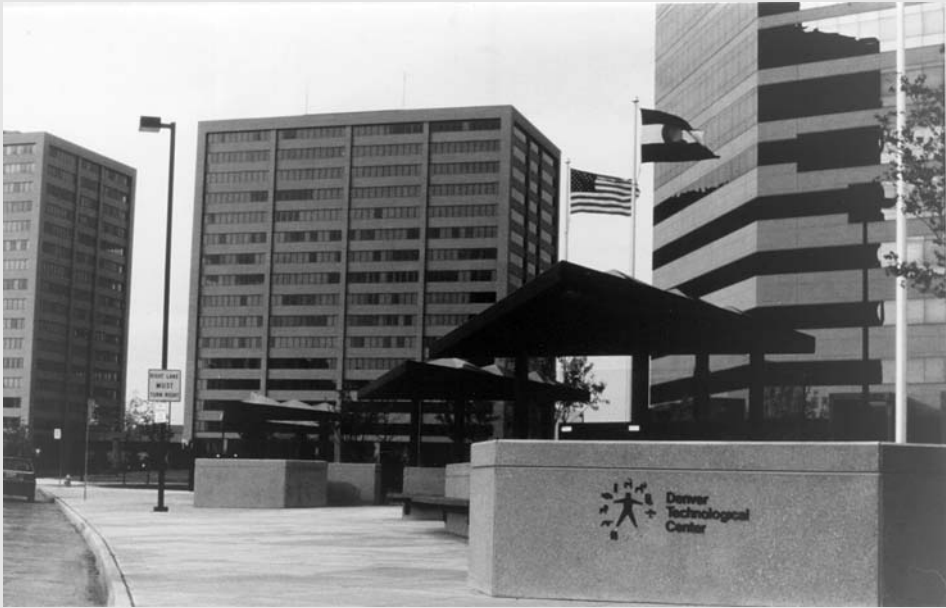
Figure 8.66 The architecture of the DTC.