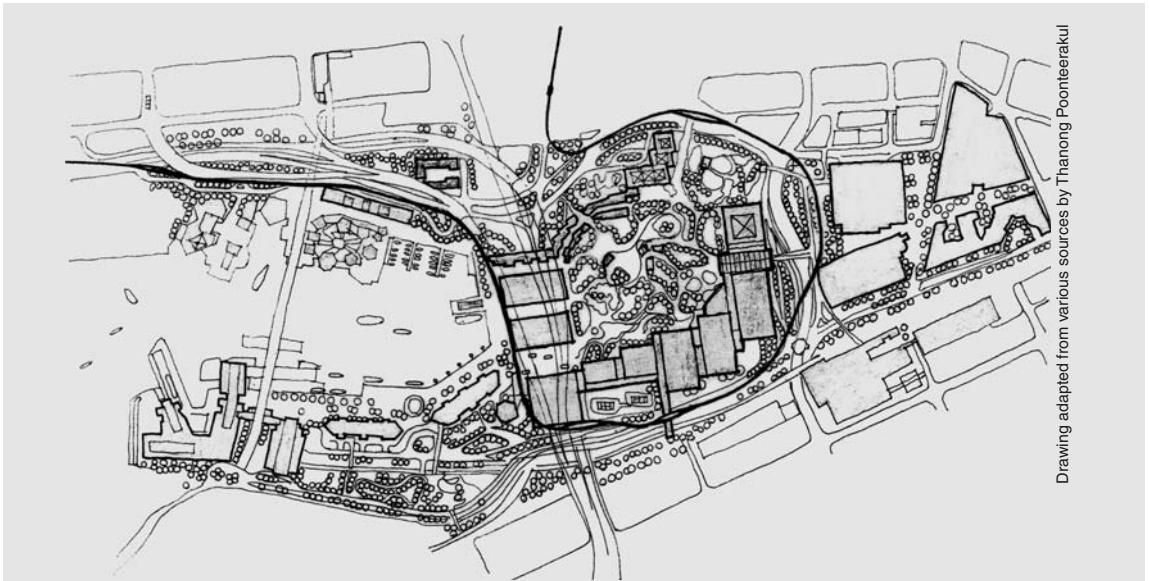
Figure 8.73 Darling Harbour: an early plan.