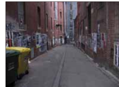
One of the non-revitalized laneways.

One of the city's principal north-south interblock links is the Causeway - Block Place - Centre Place - Degraves Street laneway sequence