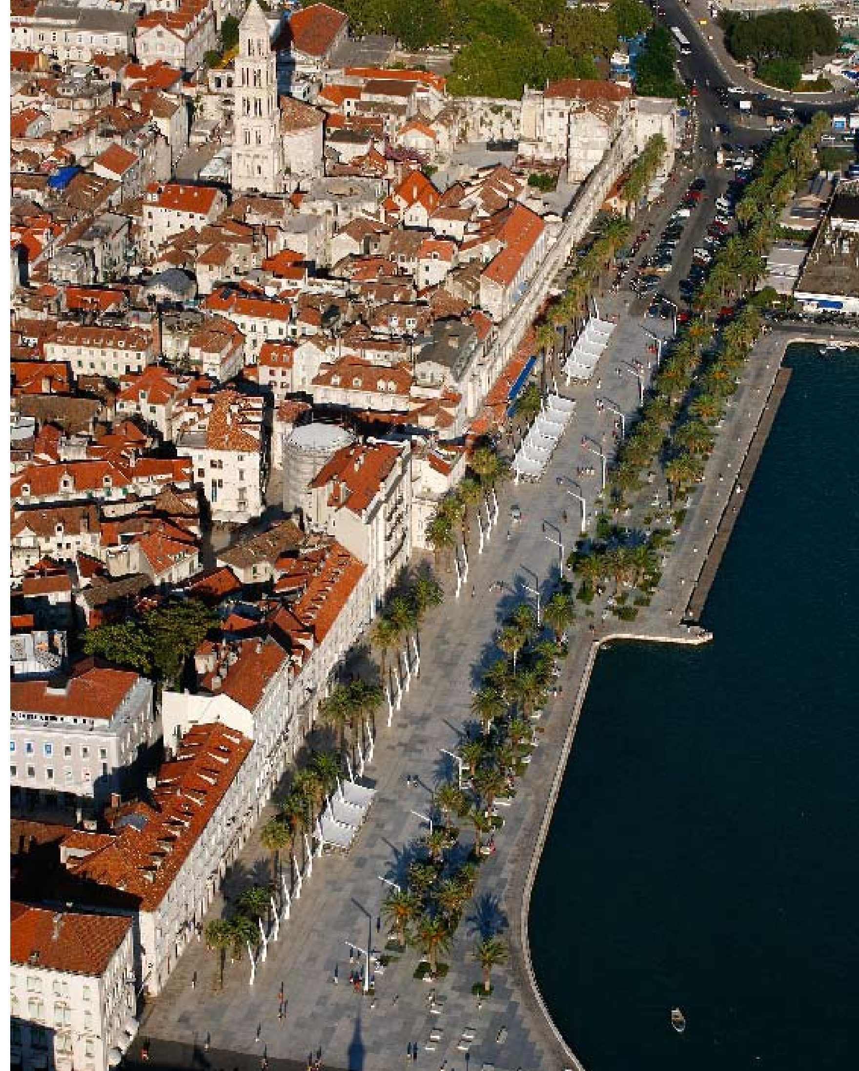
Right: Aerial view of Riva Split

The city of Split and its waterfront, the Riva, as the paradigm of its history and character, are among the most interesting and most specific sites in the Mediterranean. Split waterfront is an urbanised, public, open and accessible space, 1,700 years old. It stands in front of Diocletian's Palace, once the home of the Roman emperor. The modular Roman form of the palace in the latter phase became the framework that shaped the city and directed its expansion; in the same way, the dimensions, materials and form of the modular network of concrete elements laid on Riva directed the arrangement and positions of all the other elements of the public space. The waterfront is the focal point where the city meets the sea. 250 metres long and 55 metres wide, it is also the main public square, the space for all kinds of social events, promenade by day, parade by night, the site of sport events, religious processions, festivals and celebrations. The project rearticulates the space for all the mentioned events and harmonises them on a new integrated surface. The solution uses not only architectural design, but also materials, to respond to all the challenges of utilisation set before the Riva. All urban elements and equipment was specially designed for this project and they try to meet local spirit and atmosphere.