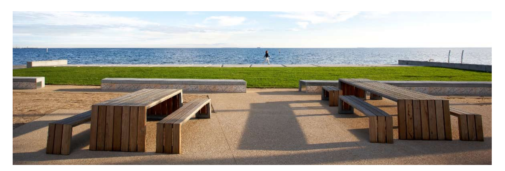
Right: Overall view of Elwood Foreshore

This project demonstrates that a seamless connection can be made between functional design (ie cars, bikes, walkers, boats, cleaners) and design elegance. The design has provided back to the community an open and inviting foreshore place, that can be used from causal to large scale, surf life saving and sailing club festivals.