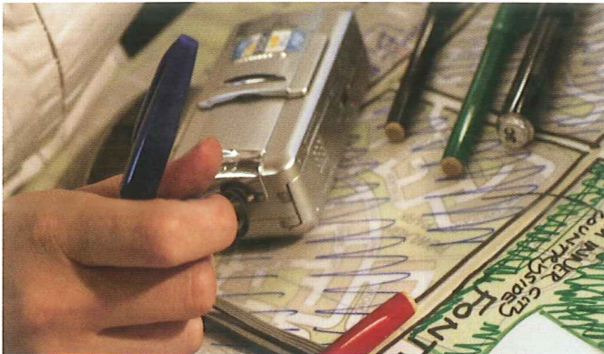
Provide a variety of pens, markers and other drawing tools. Use large ones and provide plenty of bright colours. Make sure they work first!