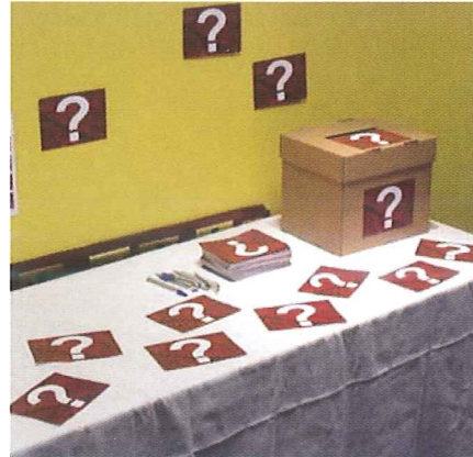
Feedback forms should be designed to encourage people to complete them, and questions framed in a way that helps the team interpret and aggregate the results.