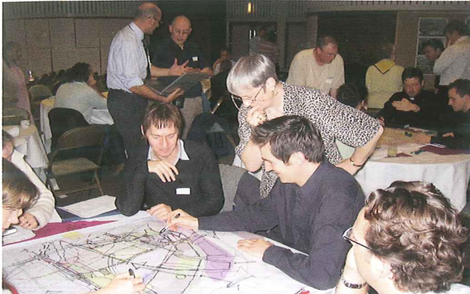
Illustrators on hand to help transfer ideas onto paper.