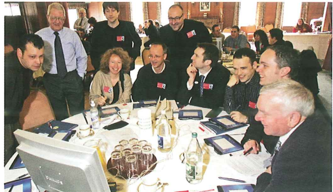
The use of computer technology at participation events is increasing. Some computer programs allow you to sketch via an electronic tablet. These methods can help stimulate discussion, with illustrations and presentations created as part of the exercise, by members of the public and/or the project team. They can also help the team to prepare workshops, especially a series of similar events with different facilitators.