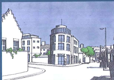
View along Columbus Road towards new mixed use landmark building.

The visioning process carried out in Scarborough is a large-scale example of community involvement, important in the development of credible regeneration strategies. Graphics play an important role in such exercises by helping facilitate discussion and communicate future possibilities.