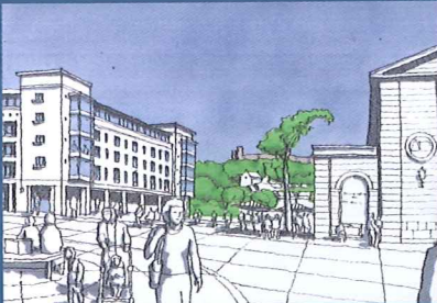
New mixed use and mixed tenure building set back from existing building line to create new market square.

Challenge: Finding and using the graphic techniques most appropriate for engaging local communities in the vision process.