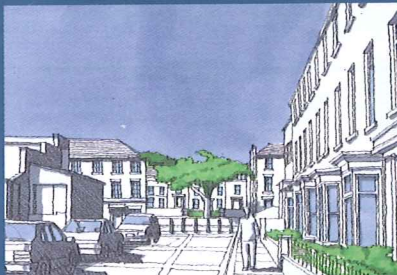
View along James Street towards new residential development on St Marys Hospital.