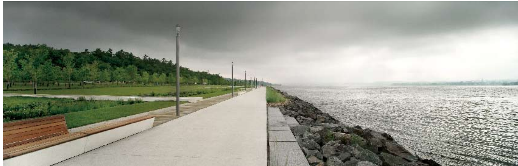
Right: Quai des Hommes

The project's underlying, yet seamless achievement is its strong contribution to the restoration of the uniquely rich and diverse, albeit fragile coastal eco-system, and to the renewed accessibility of the river.