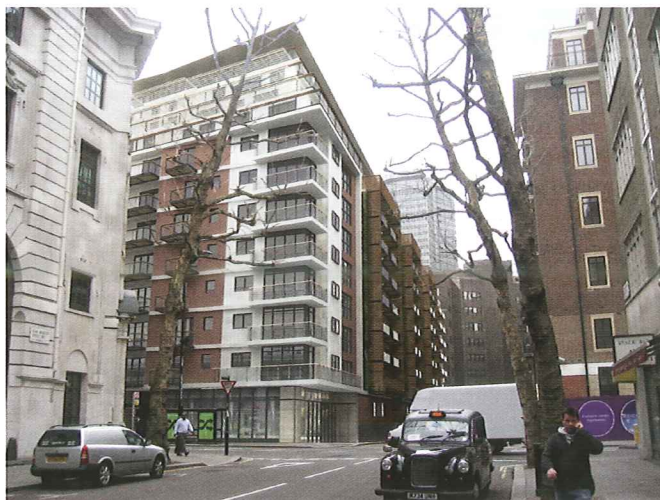
After: Computer-generated model photomontaged onto original photograph

The computer model shows the architecture in detail