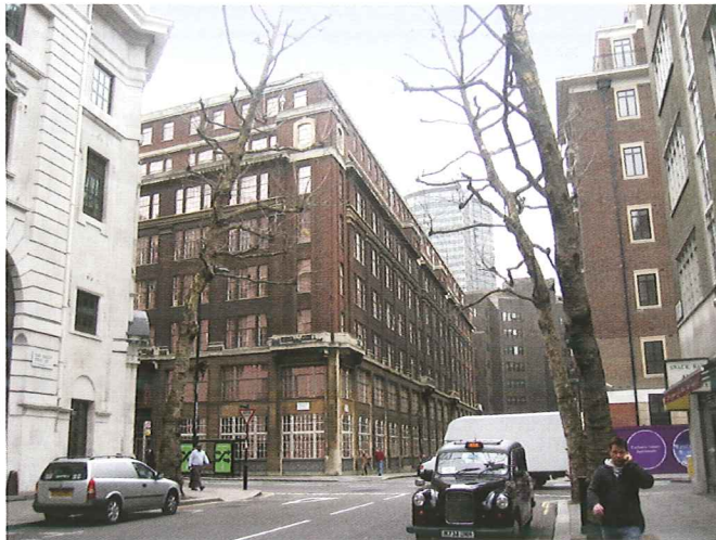
Before: Original photograph

Hand-drawn images of the proposed development can be paired with the original photograph to emphasise particular characteristics.