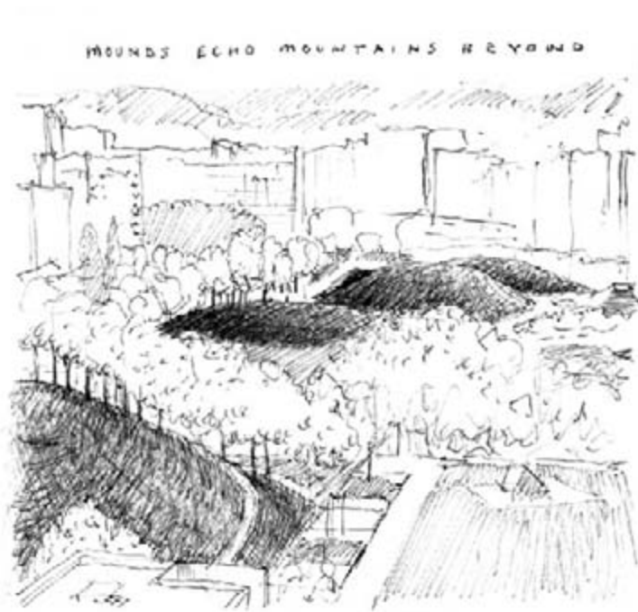
MOUNDS ECHO MOUNTAINS BEYOND