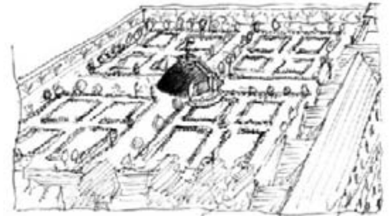
MOUNT WITH HERCULES - GARDEN OF WADHAM COLLEGE, OXFORD AFTER ENGRAVING BY DAVID LOGGAN IN OXONIA ILLUSTRATA 1675