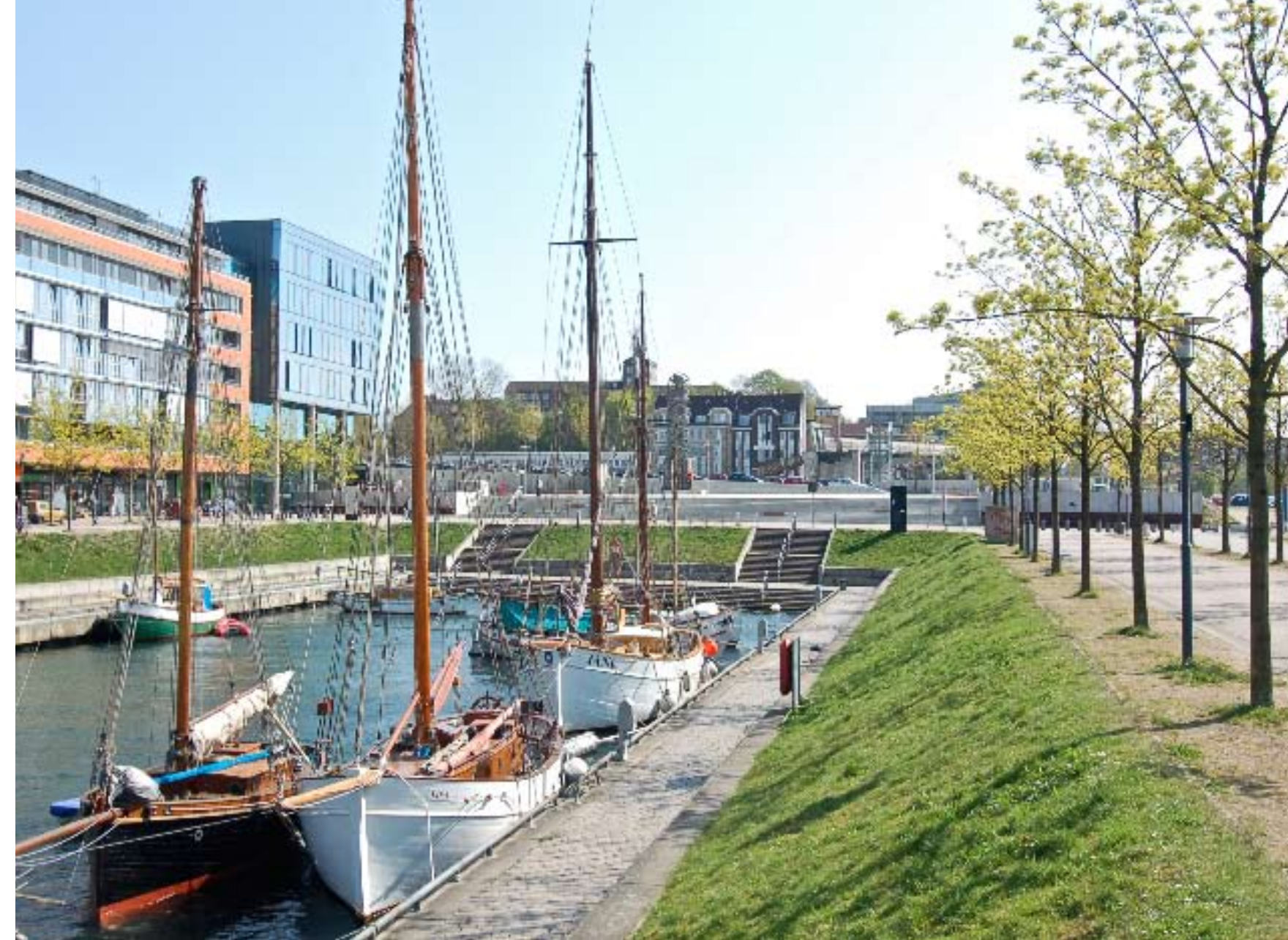
Upper right: View to the historical fishing boats in the Germaniahafen Lower right: City life on two levels

A generously designed stepway, with two flights and an integrated slow-rising ramp, enable pedestrians to negotiate this height difference. The "lower deck" offers opportunities to sit, the open-air gastronomy and freenet-centre offer time to linger. "Seefarers" can watch the bright life of the harbour in the shade of trees. The sculpture "Adam and Eve" by Björn Norgaard stands in the centre of the square.