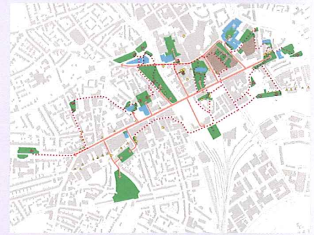
Strategy diagram incorporating interconnected urban squares and spaces

A key issue in urban design graphics highlighted in this book is the choice between computer and hand drawings. In this case, a hybrid was selected: the strategy diagrams were produced using a computer, but the detailed drawings were hand-drawn, partly at the client's request because of the impression of inhabitation and liveability that can be achieved by expressive hand drawings.