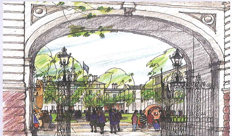
View into Robert Gordon University