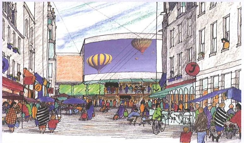
The green looking towards the refurbished Aberdeen Market