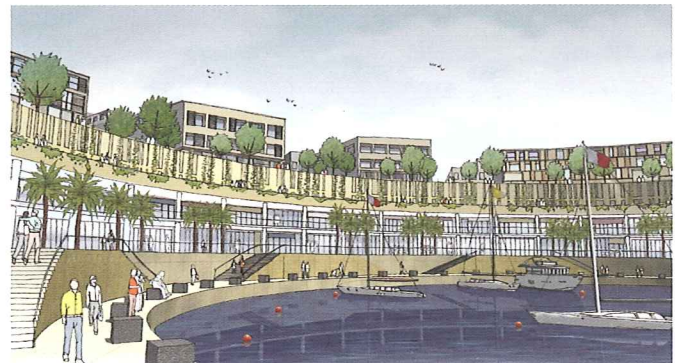
Final coloured sketch