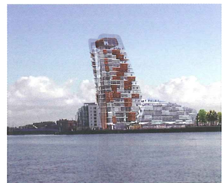
Photomontaged 3-D model