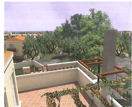
Photomontaged landscape and background