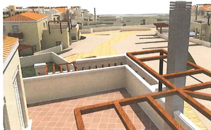
Original 3-D model