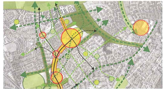
These images have been produced from a number of different software programs