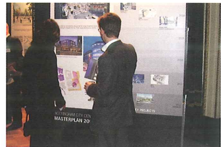
Successful exhibitions inform the audience and encourage participation

Lighting brings out the exhibition even in the darkest of settings and arenas