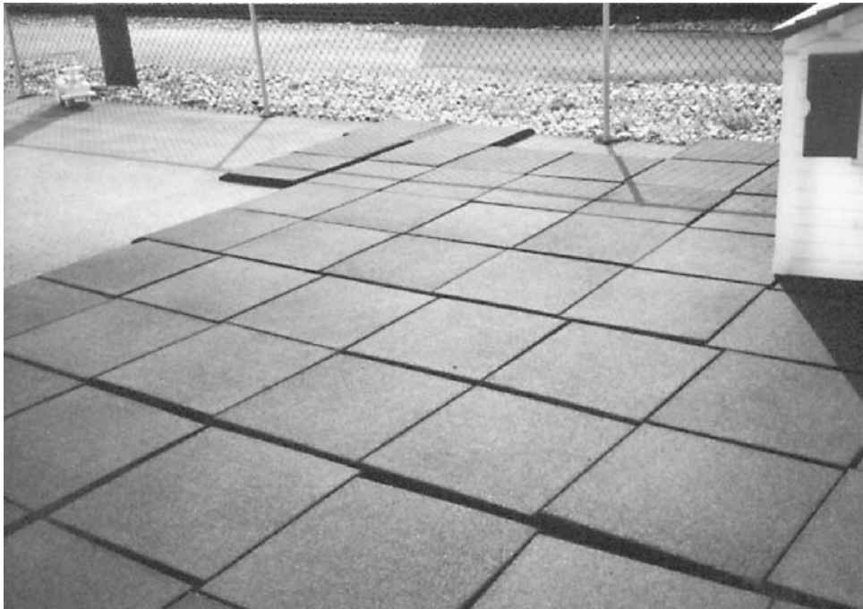
Figure 4.34 Photograph of improperly installed playground surface pads.