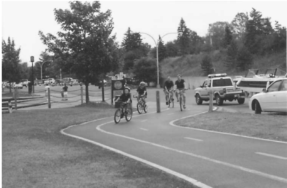
Figure 4.43 Photograph of bike route separated from automobile traffic.