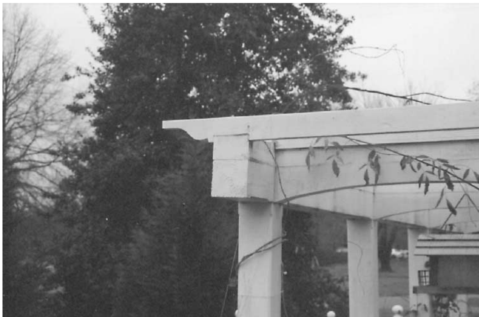
Figure 4.58 Photograph of arbor detail.