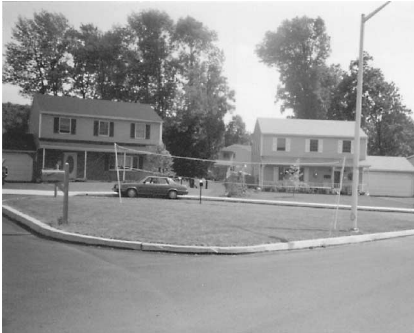
Figure 5.4 Photograph of cul-de-sac island as play area.