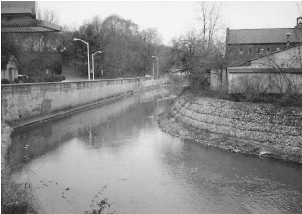
Figure 3.22 Photograph of gabion wall.