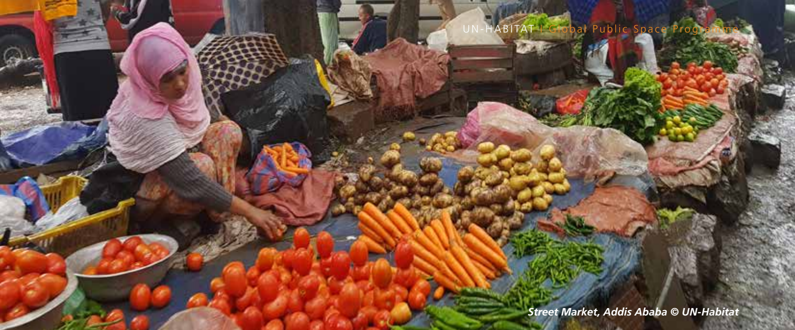
Street Market, Addis Ababa