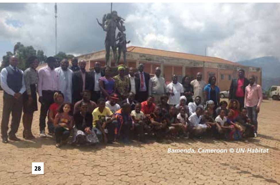
Bamenda, Cameroon

This participatory process established key recommendations to meet the current challenges faced by the city’s markets. It also informed the way forward for the renovation and modernization of markets, to meet citizens’ needs and social changes. A city-wide open public space strategy has been drafted based on the results of the assessment with two pilot projects currently implemented.