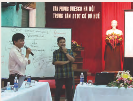
Complex of Huế Monuments (Viet Nam)

The UNESCO Office in Hanoi initiated a project to develop Disaster Risk management plans for three World Heritage properties in Viet Nam in April 2013. The World Heritage Resource Manuals on Managing Disaster Risks for World Heritage was used as the basis for the initiative.