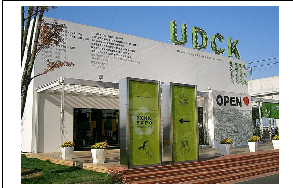
Urban Design Center Kashiwanoha