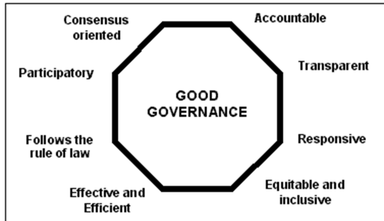
Figure 2: Characteristics of good governance